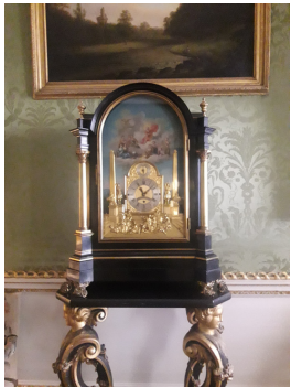
Musical clock c. 1742 by Charles Clay